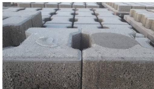
Concrete element treated with Fasil V